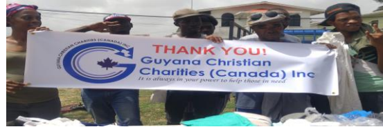
Communities expressing thanks