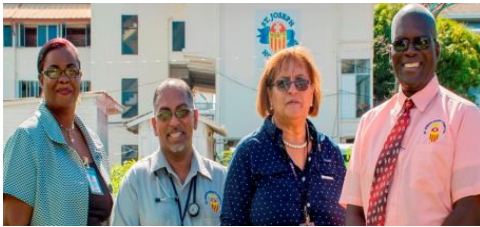
Manager of the Home with Hospital Executives

There is a clinical staff of thirty four (34) who take care of the residents, whose illness vary with Alzheimer's making up 70% overall. The most advanced stages are mostly bedridden so additional nursing care is always needed.