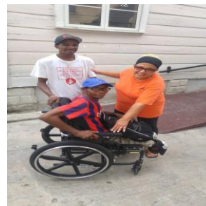
True friendship.....his homeless friend brought him to get the chair