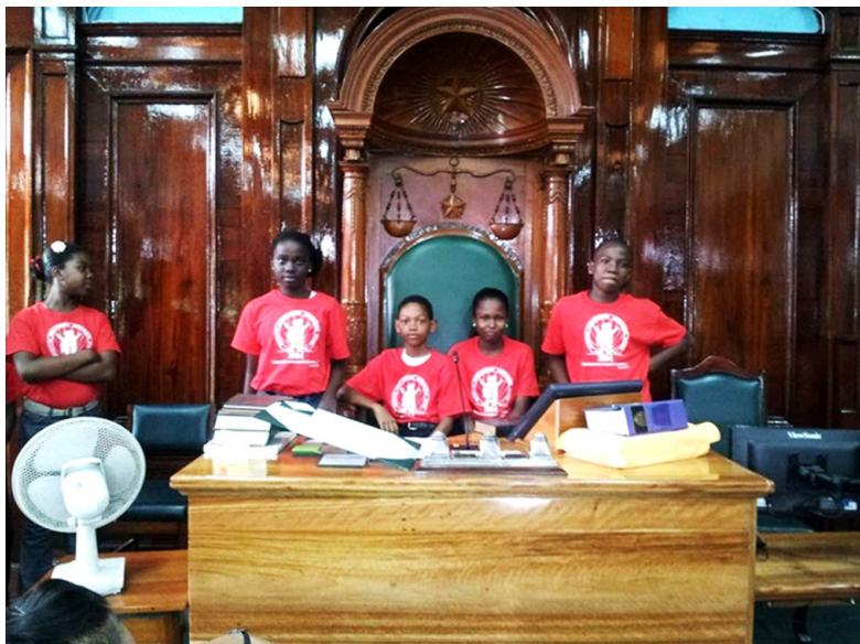
PHOTO: Some incoming secondary school students from Buxton pose in and around the Speaker’s Chair during a 2014 Buxton-Friendship Heritage Fund organized-tour of the Parliament Building.

MARTIN WINSLOW ZEPHYR , also known as “Peckatoo”, served as Speaker of Guyana’s National Assembly from 23 rd October 2000 until the 4 th May 2001. His appointment came upon the death of then Speaker of the House, Derek Jagan. Mr. Zephyr had also previously served as Deputy Speaker of the House (1998–2000). He was a British-trained barrister-at-law, and a longstanding member of the People’s Progressive Party (PPP).