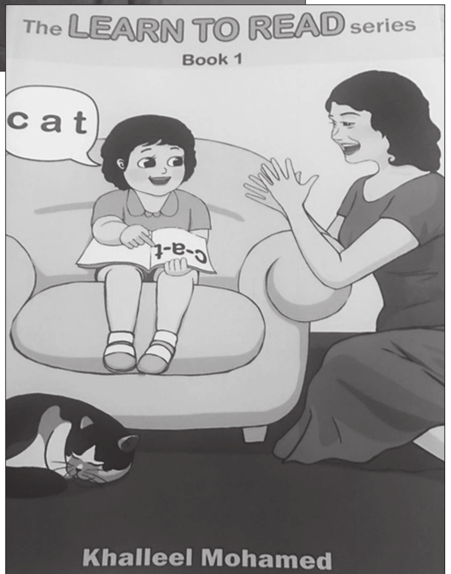
The 'Learn to Read' series is an acclaimed program for early learners.