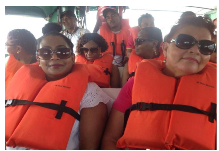
Some of our members aboard the Speed Boat headed to Bartica

The Bartica Mission Trip was indeed an adventure but we needed to present a program to the Administrators of the Hospital and nothing was going to stop us. We arrived in Bartica through pouring rain. It was an experience disembarking from our Speed Boat into puddles of water, but we were there for a purpose and we continued on to the Hospital.