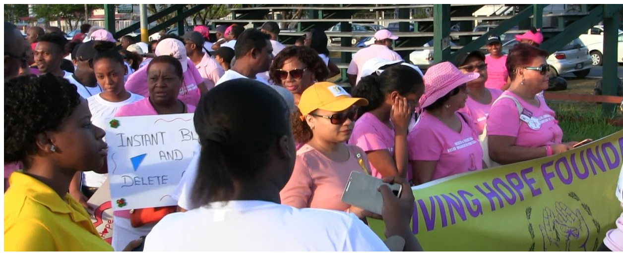
Giving Hope Foundation and H.E.R.O.C Inc. Teams heading the walk