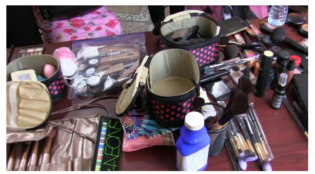
Wide variety of wigs and cosmetics for distribution and use by the Survivors/Patients

Our guests were all transformed to a point where they were unrecognizable. At the end of the session, the survivors and patients were very anxious to get home with their new look.