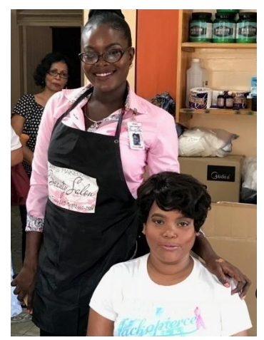
One of the Cancer Patients Before and After their make-over

They were provided with lunch and the gift bags were distributed to everyone prior to their departure. This was an exciting day and we were so pleased that we were able to make the hearts of these women so happy.