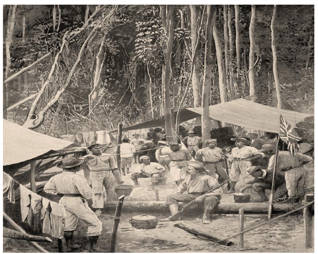
Bartica is situated at a junction of the <u>Essequibo River</u>, 50 miles (80 km) inland from the Atlantic Ocean, and is considered the "Gateway to the Interior", the town has a population of about 15,000 and is still the launching point for Guyana's gold and diamond miners.