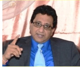
A. G. Anil Nandlall

"A letter was dispatched by us to CFATF requesting the actual deadline for us to submit the bill as passed by parliament and we received a reply that indicates to us that August 26 is actually the deadline that we have to submit the amendment passed into law to the CFATF to have it considered at the November plenary meeting," he later told explained to reporters. Nandlall, who is also the Legal Affairs Minister, said the National Assembly might have to push back the commencement of its recess which is due to run from August 10 to October 10.