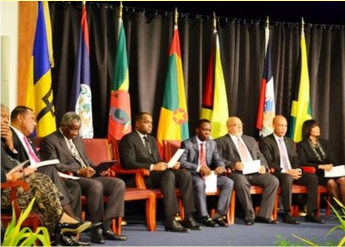
Heads of government at the opening ceremony of the CARICOM conference in Port-of Spain, Trinidad & Tobago

PORT OF SPAIN, Trinidad (GINA) -- The opening ceremony for the 34th meeting of the conference of heads of governments of the Caribbean Community (CARICOM) was held on Wednesday evening in Port of Spain, Trinidad and Tobago.