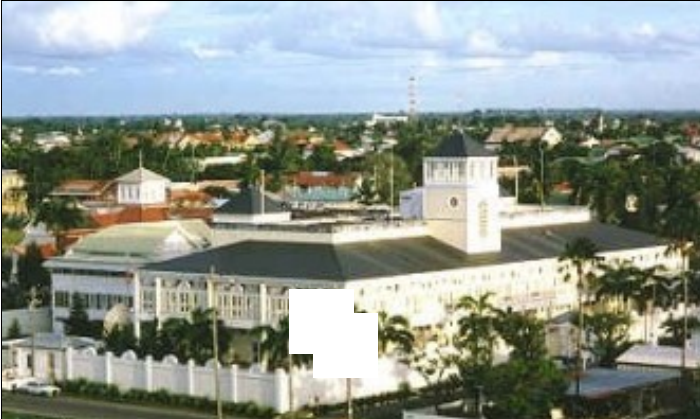
USA Embassy in Georgetown, Guyana

July 3, 2013:(Demerara Waves): The United States (US) is probing another visa racket allegedly involving another Consular Officer, the State Department has confirmed. "The Department of State is aware of allegations of improprieties relating to a Consular Officer formerly assigned to Georgetown, Guyana," according to a statement issued through the embassy here.