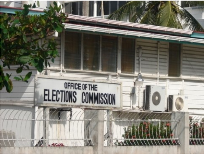
Office of the Elections Commission in Georgetown