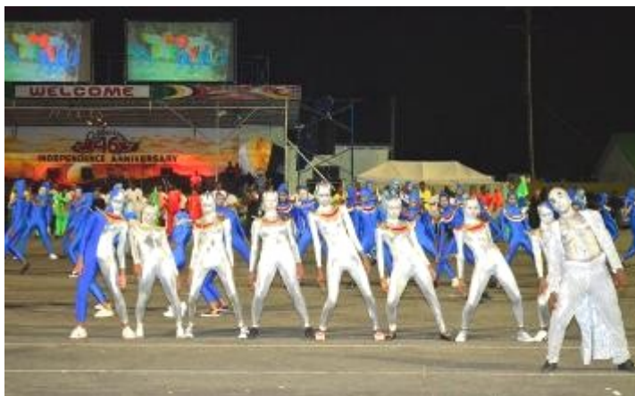
A section of the 435 youths performing a choreographed dance at the National Park during Guyana's 46th Independence Anniversary Celebration

Thousands of Guyanese flocked the National Park last evening of May 25th, to witness the hoisting of the Golden Arrowhead on the occasion of the 46th anniversary of the country's independence.