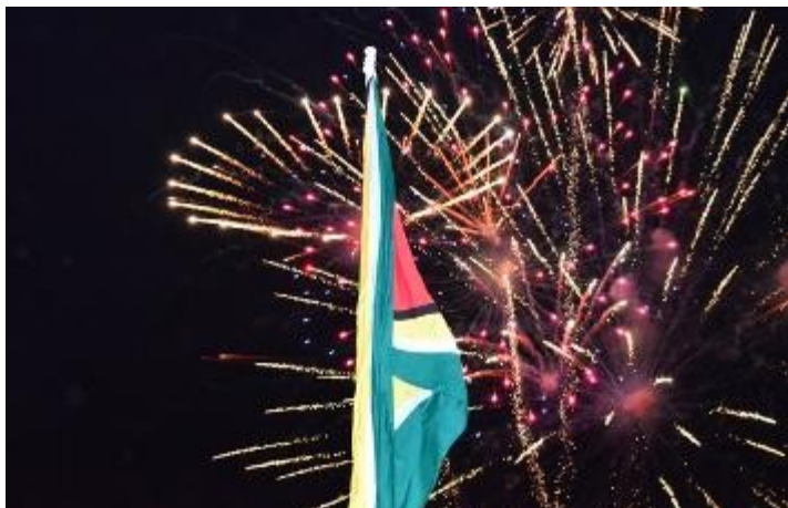
The Golden Arrowhead hoisted as fireworks lit up the sky during Guyana's 46th Independence Anniversary Celebration .