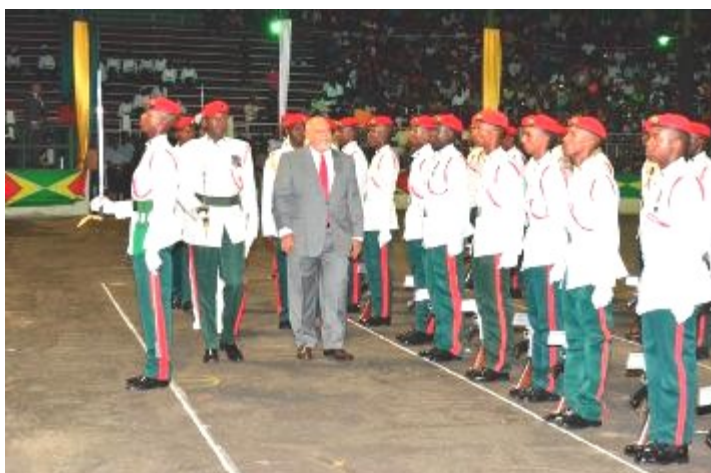
President Donald Ramotar inspecting the Guard of Honour during Guyana's 46th Independence Anniversary Celebration in the National Park