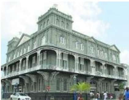
The historic Mutual Building. Bridgetown. Barbados