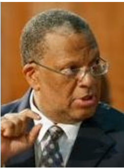
Dr Peter Phillips

KINGSTON, Jamaica (JIS) May 29, 2012 -- Jamaica must work to reduce its debt, even as negotiations continue on a new standby arrangement with the International Monetary Fund (IMF), said Finance and Planning Minister, Dr Peter Phillips.