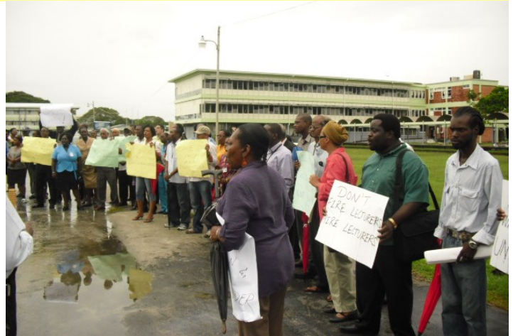
FLASHBACK: Workers started taking action with a lunch break picketing exercise.