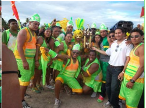
The winning Mash Band in the Rupununi