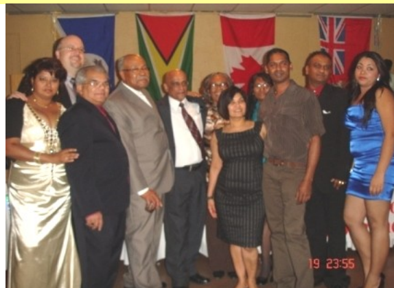
Some of the attendees at the GAM Awards Ceremony