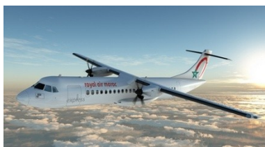
ATR600 information web page