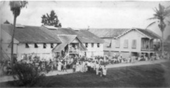
[1] The East Indian Immigration Depot on Battery Road Kingston

One of the earliest records we have of Kingston, which is now Ward No.1 in Georgetown, appears in Dr. Pinkard's "Letters" where he describes "An English village contiguous to fort and camp with neat, good houses, painted white, on brick foundations and covered with wallaba shingles." This letter was dated April, 1796. It is generally agreed that the village was named after the capital of Jamaica.