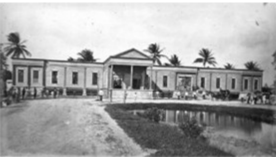
[2] The Georgetown railway station on Lamaha Street, Kingston

North of Eve Leary, we read of two plantations, Kierfield and Sandy Point but, by 1804, these had been entirely washed away. The foreshore was covered with courida swamp with the exception of the strip extending from Fort William Frederick to Camp Street. This sandy stretch was the scene of many a duel fought by the gentlemen of the time and later of band concerts by the band of the West India Regiment. Horse racing could also be seen on the beach prior to the use of D'Urban Race Course in 1829.