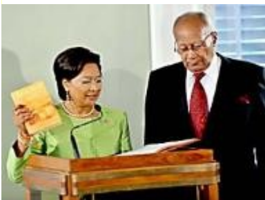
Kamla Persad-Bissessar takes oath of office on May 27, with President Maxwell Richards officiating.

Posted By Stabroek staff - May 28, 2010 - Editorial | Comments