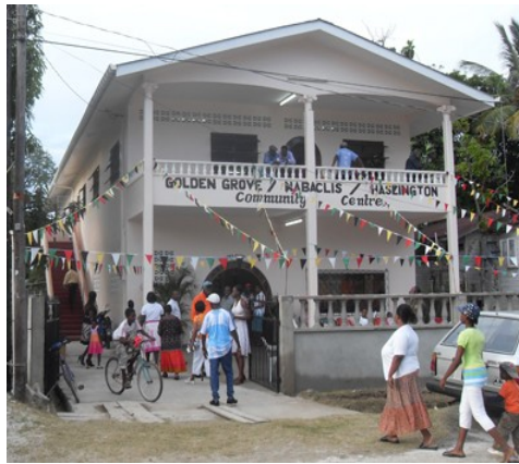
The spanking new multi- purpose community centre at Golden Grove, East Coast Demerara.