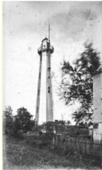
Lighthouse, built in 1830

The barracks described here were erected in 1837. Rodway, in his "Story of Georgetown," says that these fine, spacious barracks for troops had replaced the poor confined ones formerly in use, where soldiers